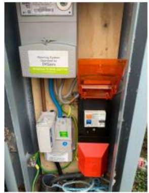
Meter installed within small feeder pillar