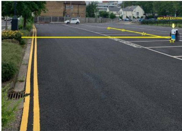
Charge Point locations