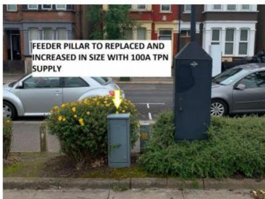
Feeder Pillar currently to be removed