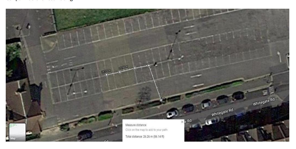
Civils 26m Dig