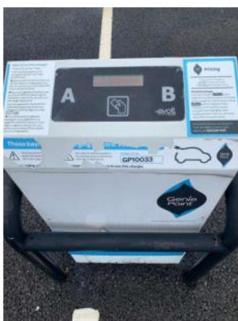
Exisiting Charge Point